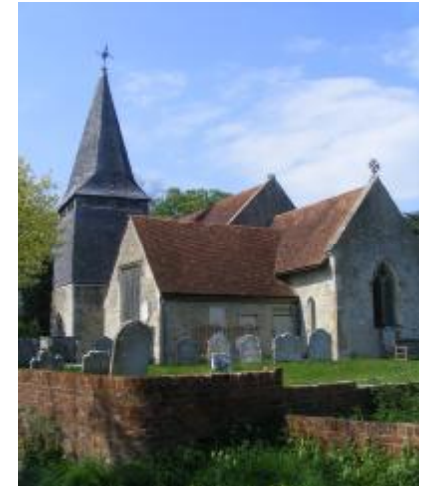
Supporting the Churches of St. Boniface Nursling and St. John's Rownhams